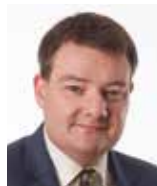
Magni Laksáfoss (B)